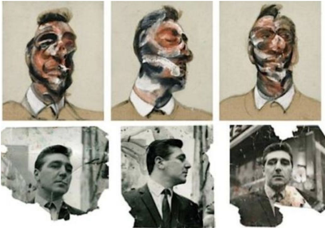
Francis Bacon-Three Studies for Portrait of George Dyer

After displacement, our mind comes to the third stage - Symbolization. According to The Dream Work, our minds will find a “symbol” as fetish once they faced a great castration in lives. Through this fetish, our minds created a distance between fantasy and reality. So even we seem like accepted the realities, we could emotionally deny it. In my work, I made a box-like machine and cigarettes as the protagonist’s fetish. And in the final, after the protagonist smokes the cigarettes and unboxes the machine, he is relieved, which means by “successfully” committed suicide.