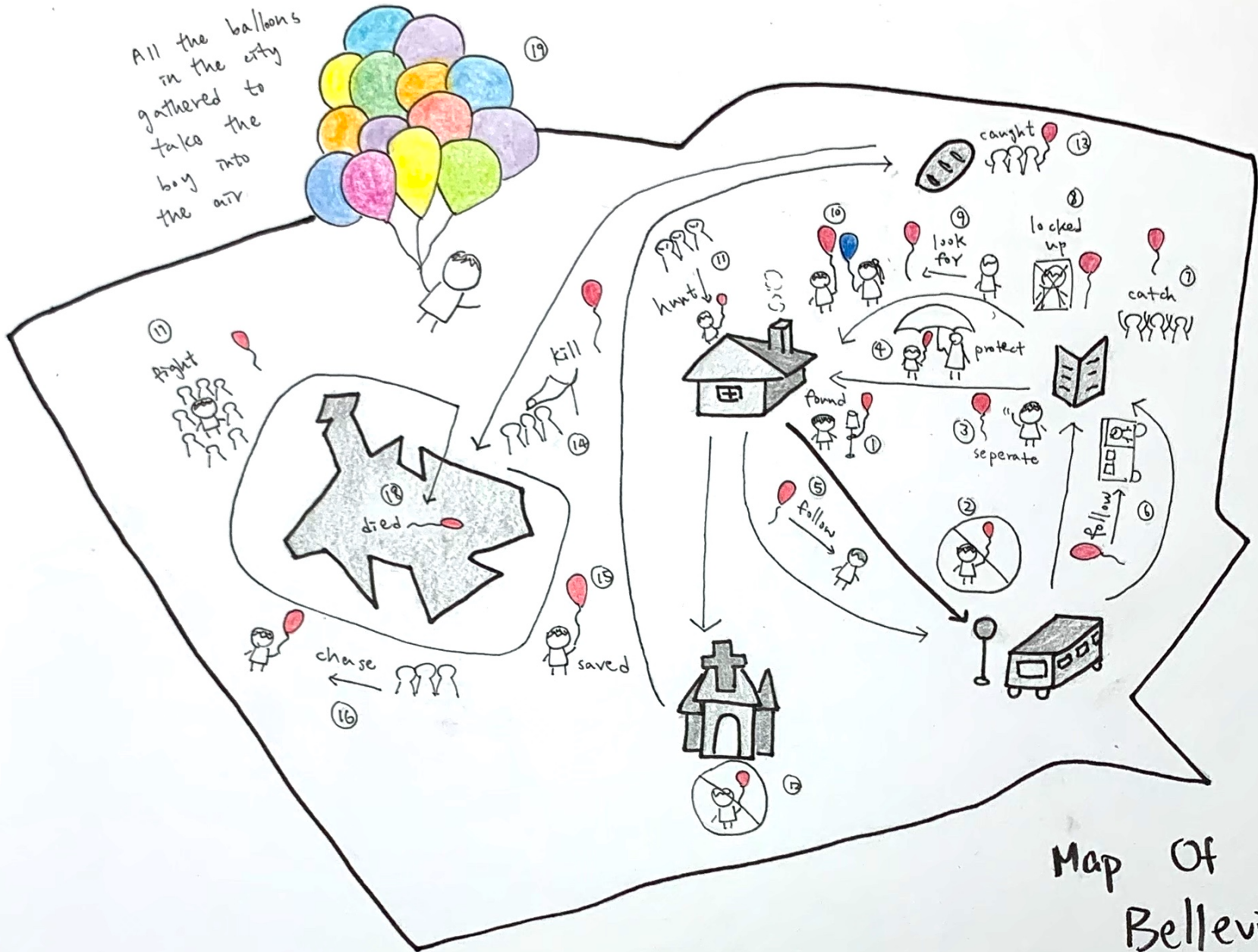
Map of Belleville, Paris